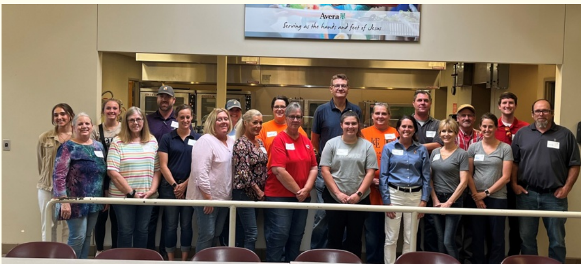
Our team served over 340 people at the Banquet