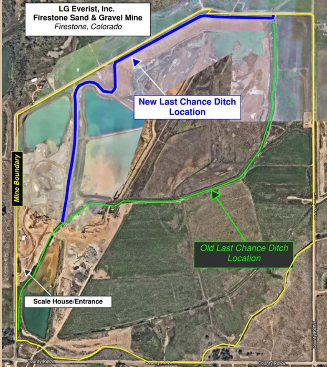
New vs. old ditch