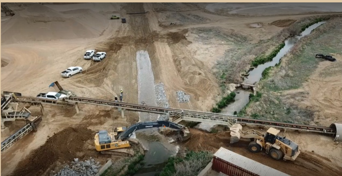
Diverting the water on May 4, 2023

With this relocation and abandonment project, we have extended our reserve