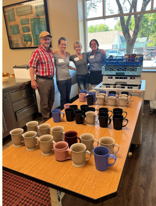
The serving crew